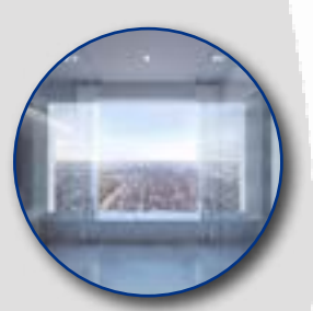
505 West 19th Street, #PH1 $22,000,000 Approx 3,575 ft<sup>2</sup>